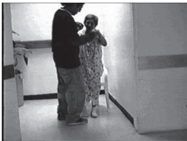
Figure 2. Patient in Hoehn & Yahr stage 4, with great shaking, rigidity and bradykinesia. Apart from alterations in marching and posture, which if it were not with the help of the relative, the patient would fall down.

Current treatment of Parkinson's consists in the replacement of dopamine through the use of its precursor, L-dopa, or of substances increasing the activity of this neurotransmitter at stimulating dopaminergic receptors (ropinirole, pramipexole, bromocriptine). Other drugs work by inhibiting enzymes which destroy dopamine such as catechol-O-methyltransferase (COMT) (entacapone) and type B monoamine oxidase (MAO B ) (selegiline and rasagiline).